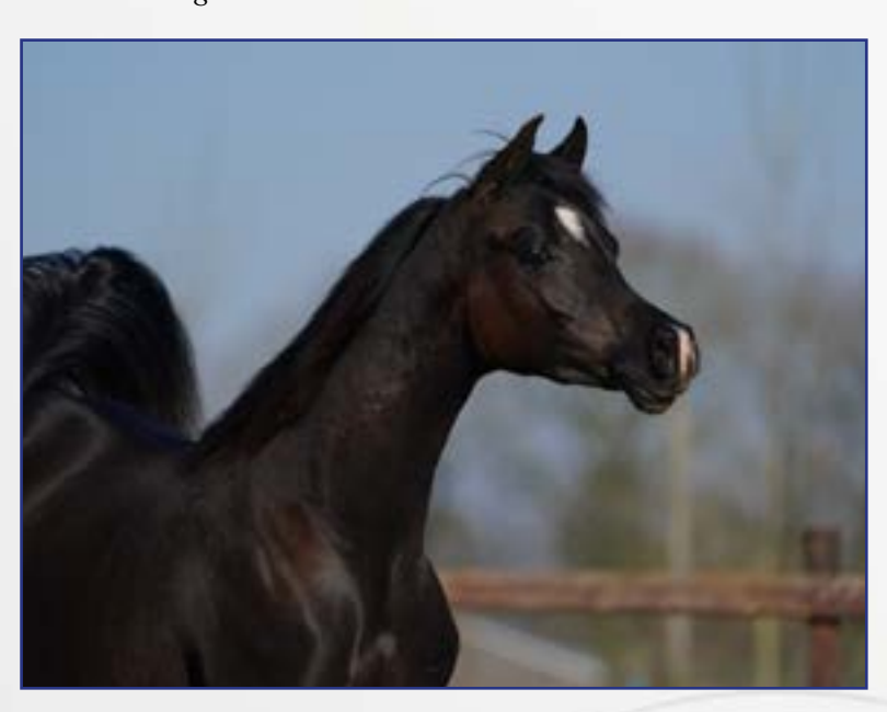
ASE Justice el Jamaal (WH Justice x Geraldyne el Jamaal) Now owned by Al Dawla Arabians, Australia

Geraldyne has been a true gift to Arabian Stud Europe and it will be excited to see what the future will bring!