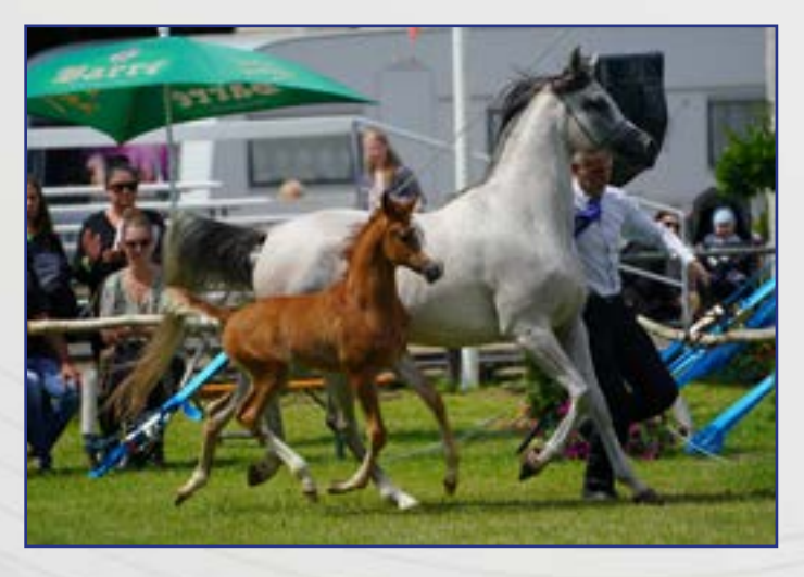
ASE Hafez el Shiraz (ASE Zad Shiraz x ASE Konooz) Bronze Medal champion, Interantional B-show Ströhen