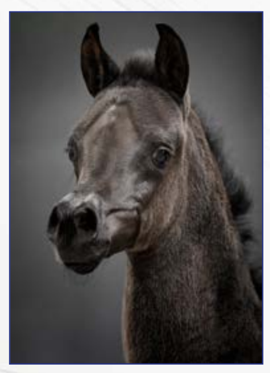
Guinevere PKA (Magic Magnifique x Geraldyne el Jamaal) Bred and owned by Peka Arabians, The Netherlands