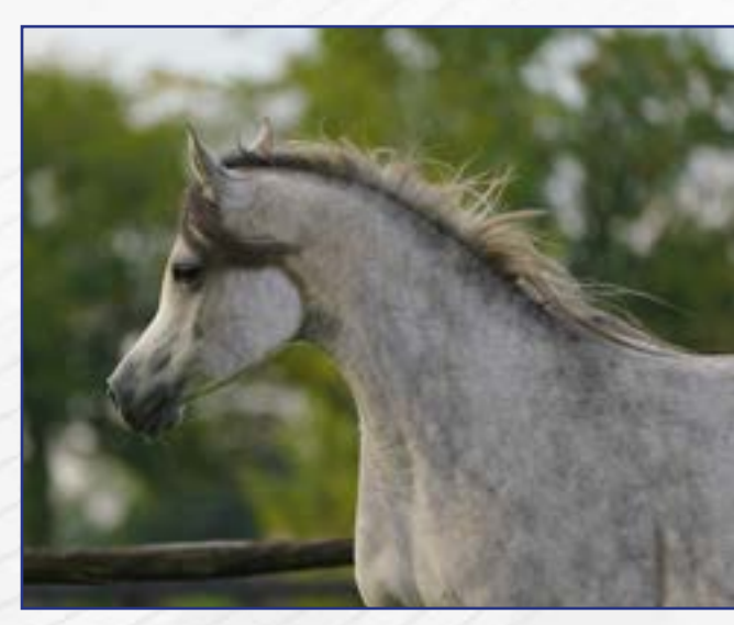
ASE Kamiliya Hlayyil (Kahil al Shaqab x ASE Bisiriya Hlayyil)

The other stallion is the 5 years old ASE Juilliard, who is making a big name for himself within the Arabian Horse community, one foal at the time.