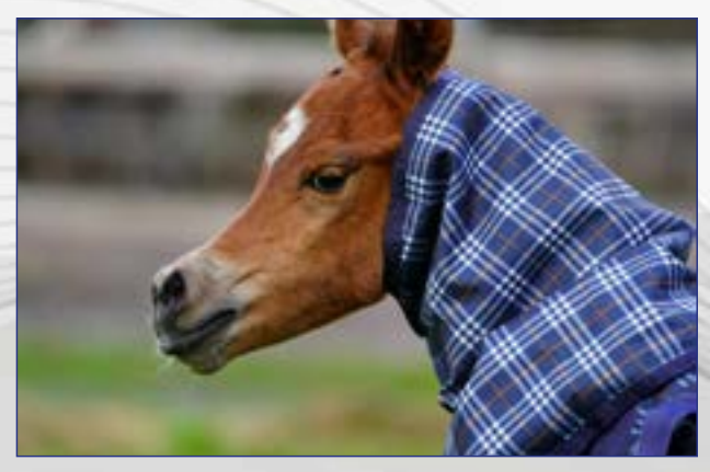
ASE Falicia (ASE Farhan x ASE Falaree)