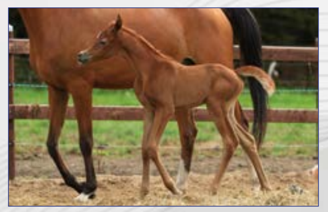
ASE Faiana (ASE Magnificent x ASE Falaree) sold to Belgium