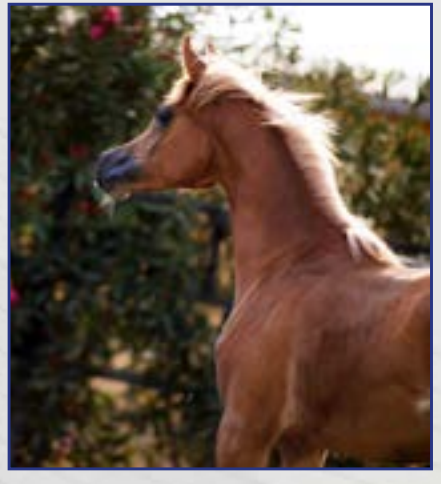
Qamar al Jood (Qaysar al Jood x Geraldyne el Jamaal) Bred and owned by Al Jood Stud, Qatar