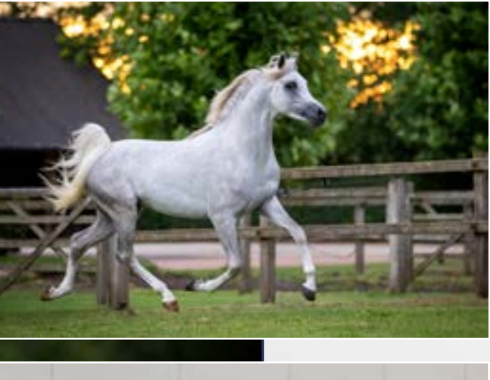
ASE Zad Shiraz during the Sport Horse Stallion selection test

In 2020, the first foal crop of Shiraz was born. One of them was a beautiful colt out of ASE Konooz (Hariry al Shaqab) named ASE Hafez el Shiraz. This colt was shown at the International B show in Ströhen, Germany where he got through to the final overall foal championships, where he got one vote for Gold and ended up with the Overall Bronze medal, charming everyone with his fantastic movement. Hafez is now sold to Morocco.