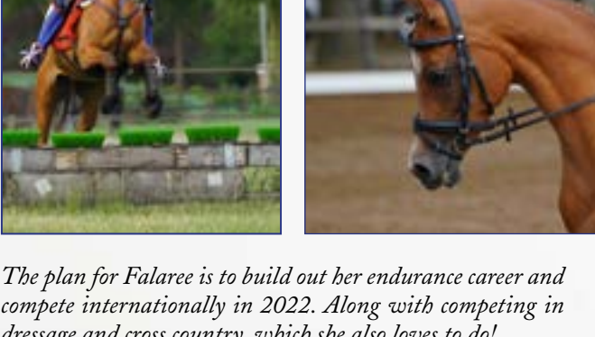
The plan for Falaree is to build out her endurance career and compete internationally in 2022. Along with competing in dressage and cross country, which she also loves to do! For now, her daughters ASE Faiana and ASE Falicia will continue her line in the Arabian Stud Europe breeding program.

In 2019, ASE Falaree gave birth to her first foal, a beautiful grey filly named ASE Faiana by the farms junior stallion ASE Magnificent. After weaning, Falaree was brought back in condition and won the 40km endurance in Ankum, Germany. She continued this success by winning the 53km in Leende, The Netherlands in 2020. Due to Covidrestrictions, she was not able to continue much in endurance and in January this year, she gave birth to a very pretty filly named ASE Falicia. Sire of this filly is multi champion ASE Farhan (RFI Farid x ASE Bisiriya Hlayyil) who was sold to Ultimate Stud in Switzerland in 2020.