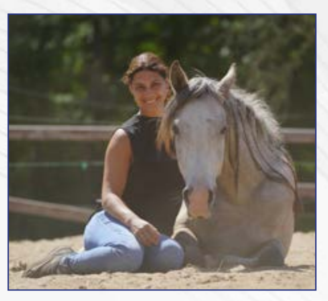
ASE Aaliyah Hlayyil (Hlayyil Ramadan x Manilah) bred to El Jahez WH for 2022